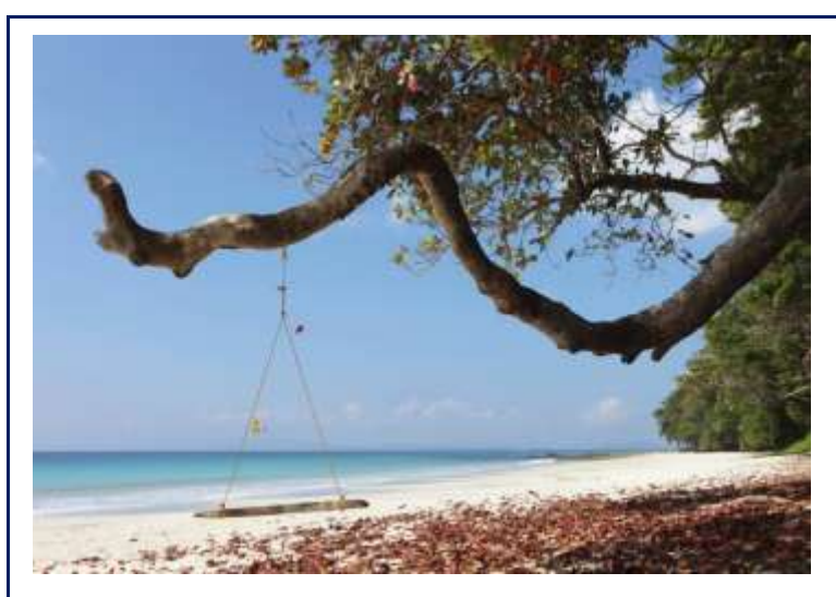
Embrace the Sun, Sand and Salty Breeze at The Andaman & Nicobar Islands

With a breathtakingly beautiful coastline, white sandy beaches, indigenous tribal cultures, a lush forested interior, coral reefs and plenty of water sport activities – the Andaman & Nicobar Islands are just the respite your clients need for a getaway from their tour through mainland India. The archipelago offers a rare off-the-beaten-track experience that is perfect for those who seek seclusion and solitude.